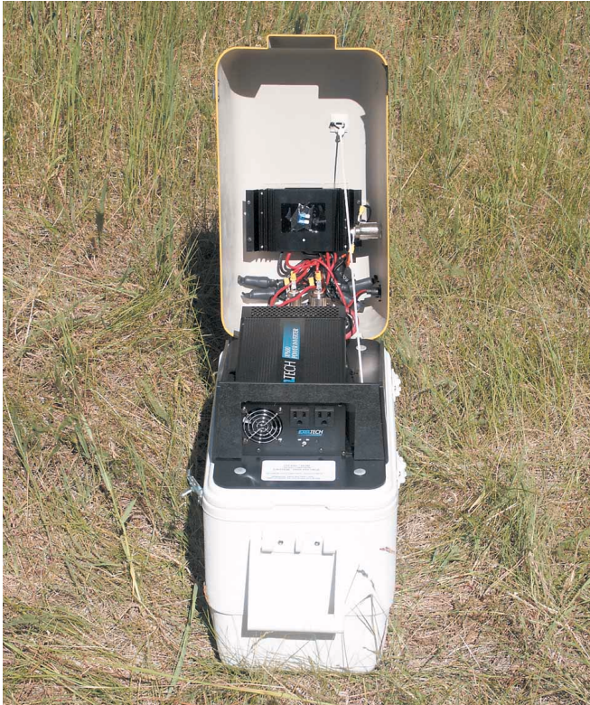
A 600 watt Exeltech inverter provides high quality power. The AGM battery is housed below in an insulated space.

available. Other options include a three-module unit for increased PV charging, a portable field office option that adds a work table to the unit's frame, and lighting and message display versions.